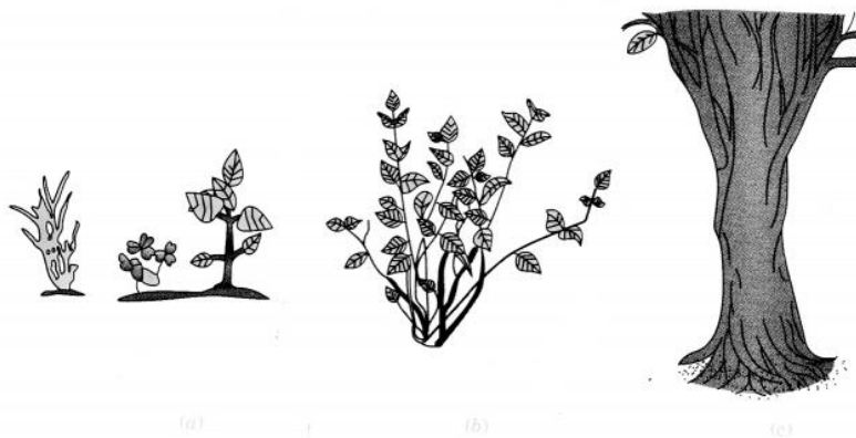
(a) Herb, (b) Shrub and (c) Tree